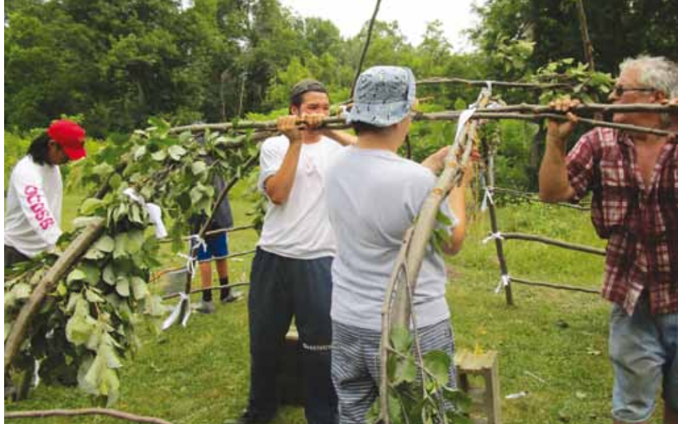
Akwesasne for-credit on-the-land camp students learn teachings around harvesting willows and building a sweat lodge.

"They walked away with a whole different outlook on things. It was power-