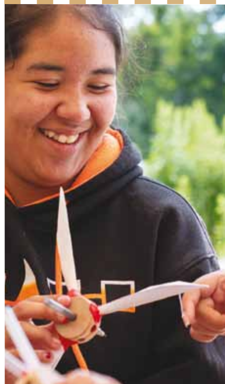
Students learned about engineering and designing wind turbines.

“It has been a combination of things and people who have told us for a long time it’s about bringing together all the